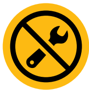
NO DAILY MAINTENANCE