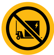
NO BATTERY CHANGING